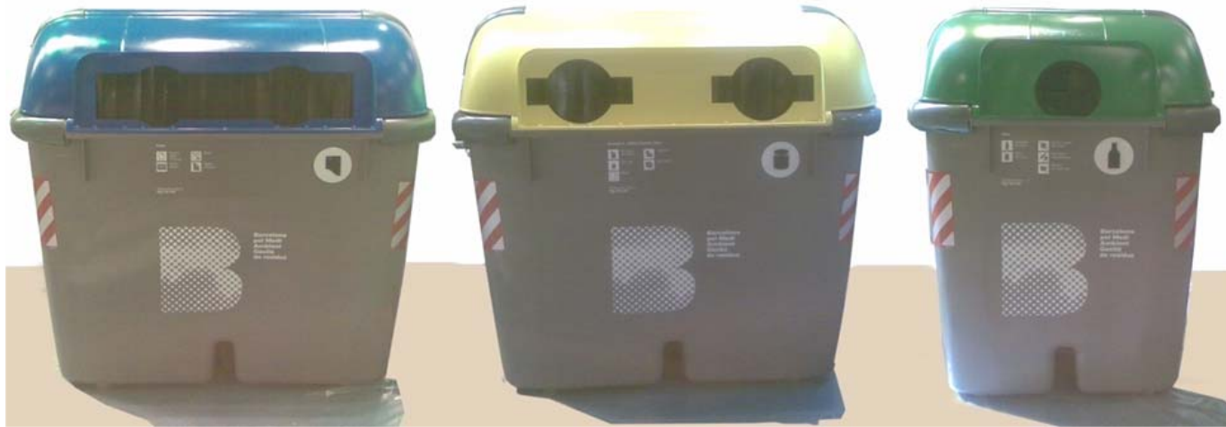
Rubbish skips with RFID sensors

Use of innovative services & robust telecom infrastructure at street-level