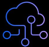
IoT Platform Academy