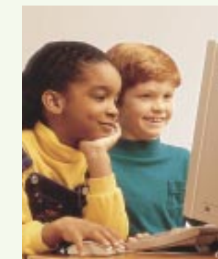
Information technology is a key tool for improving and expanding education—the centerpiece of IBM's corporate philanthropy program.