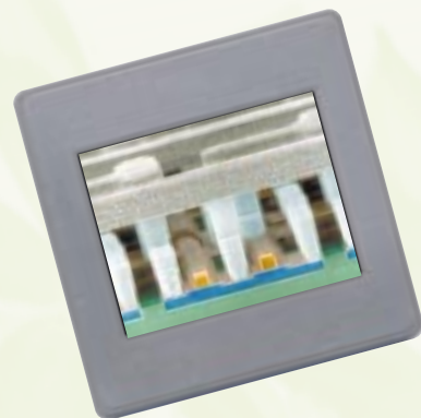
A microscopic image of IBM's Silicon-on-Insulator (SOI) technology. SOI technology results in faster computer chips that require 1.7 to 3 times less power than the older bulk CMOS chip technology.

From this global environmental management system and integration of environmental considerations throughout the business to its processes, products and contributions toward sustainable development, IBM's initiatives cross a broad spectrum. This brochure identifies some of the accomplishments IBM has made since 1990 in its quest for continual improvement and highlights the leadership that resulted.