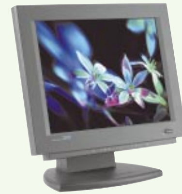
IBM's flat-panel displays are one-sixth the depth and 85% of the width/height of the equivalent cathode ray tube (CRT) products. They use 50% - 66% less energy and generate less than one-third the heat of the equivalent CRT.