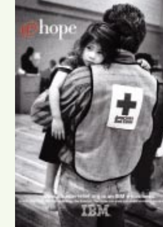
IBM, the American Red Cross and the Cable News Network (CNN) created a Web site for global disaster relief information. The site, www.disasterrelief.org , contains up-to-date coverage of disaster relief efforts, along with the capacity to offer services, support and contributions. IBM is providing the technology, consulting and services for the site, as well as cash contributions to the Red Cross.