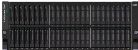
Figure 2 – The IBM Storage Scale System 6000 delivers up to 340 GB/s throughput, 28 million IOPS, and up to 2.2 PB of raw capacity in a compact 4U rack.

IBM Storage Scale System 6000 is a high-performance hardware platform that combines IBM Storage Scale software with NVMe flash technology to deliver extreme throughput and massive scalability for AI, data analytics, and storage-intensive workloads. It supports up to nine SAS hard disk drive expansion enclosures for flexible capacity growth and leverages IBM Storage Scale RAID erasure coding for enhanced data efficiency, hardware failure mitigation, and intelligent monitoring with dynamic data tuning.