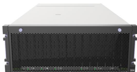
Figure 3 – The IBM Storage Scale System Expansion Enclosure enables organizations to cost-effectively deploy workloads operating on massive data sets.

With support for up to nine enclosures per system, it scales to 18PB per rack over 24Gb SAS, allowing organizations to efficiently manage multi-petabyte workloads with speed and reliability.