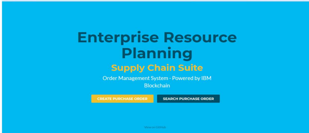
Figure 3. Home page