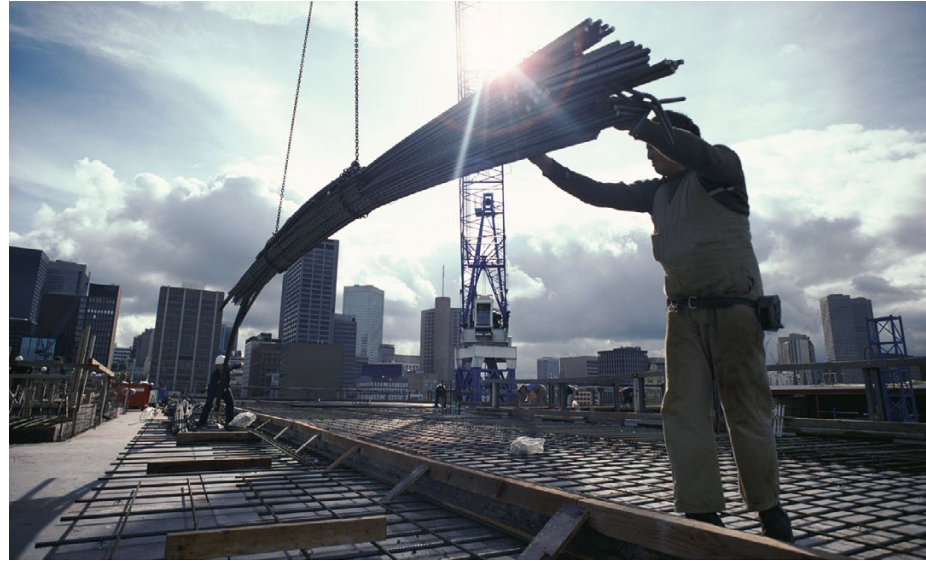
Building construction site

Technology plays a key role in Scott Equipment's ability to adapt to changing levels of orders. Turning its attention to its existing infrastructure, the company realized proactive change would give them a competitive advantage.