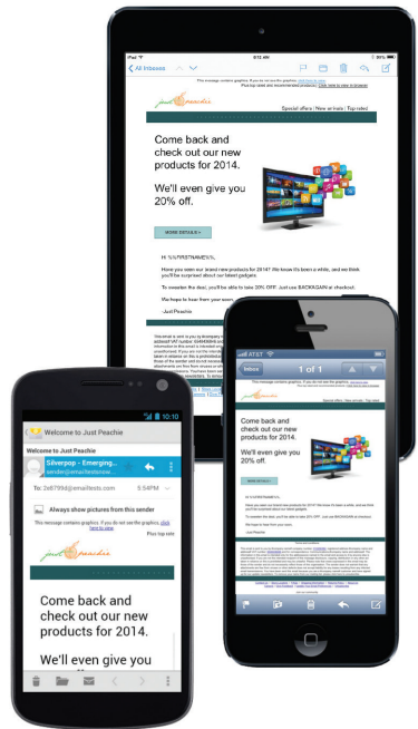
Figure 1: iPad Mini, iPhone 5 and Android email previews