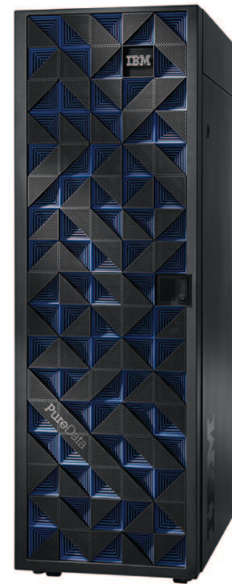
Figure 1. PureData System for Analytics

IBM PureData System for Analytics is a scalable, hardware-accelerated, massively parallel system that enables clients to gain insight from enormous data volumes, 10 - 100 times faster than they can with traditional systems, 1 without the need to copy the data onto a separate analytics server.