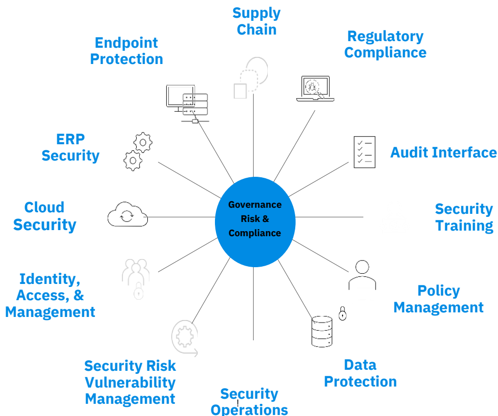
Figure 2. The landscape of governance, risk & compliance