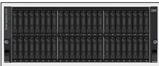
Figure 2. IBM Storage Scale System 6000 is a hardware appliance that allows you to deploy IBM Storage Scale on thousands of nodes with TB/s performance, low latency, and tens of millions of IOPS per node.

This edition provides identical functionality to IBM Storage Scale Data Management Edition plus the support for storage rich servers. IBM Storage Scale Erasure Code Edition provides network-dispersed erasure coding, distributing data and metadata across the internal disks of a cluster of servers. This allows IBM Storage Scale to use internal disks as reliable storage with low overhead and high performance.