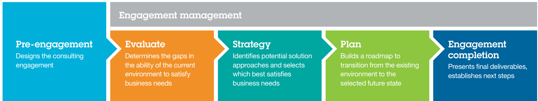
Figure 1. Your engagement will run in five stages: pre-engagement activities, evaluation, strategy, planning and engagement completion.

data ). Your organization and IBM will also work together to develop a project plan—a document against which the progress of your engagement will be measured. Finally, your project manager will explain IBM's standard consulting methods.