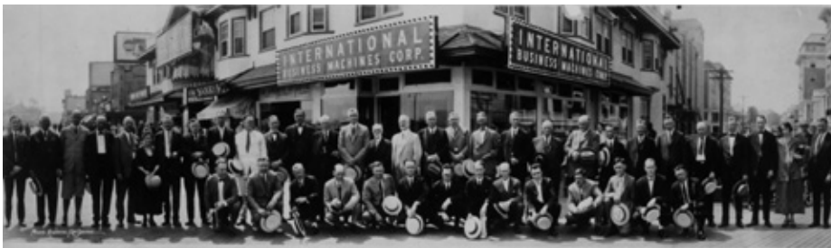
The Hundred Percent Club—1925