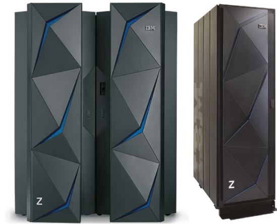
IBM z14 Models M01-M05 and IBM z14 Model ZR1