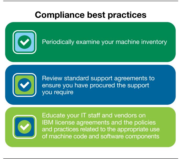
Figure 3. Ensure that your organization remains compliant by following these compliance best practices at least annually.

Licenses and support agreements may expire, renew or terminate, systems are replaced, IT personnel changes – and without the proper disciplines, you can lose track of your inventory. Scheduling periodic reviews of your installed inventory and support agreements can help. The best practices shown in Figure 3 can help you avoid unnecessary costs and fees, and minimize the liability risk that comes with non-compliance.