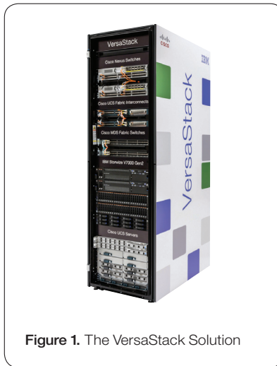
Figure 1. The VersaStack Solution

VersaStack solutions from Cisco and IBM let you scale and repurpose systems without having to adjust your software and networking capabilities or interrupt operations. (Figure 1). You can scale your environment up if you need greater performance and capacity—adding computing and network resources individually as needed—or you can scale it out if you need multiple consistent deployments by adding integrated systems. You can add flash-memory capacity to support multiple applications, and you can scale the virtualized storage system out to increase the number of I/O operations per second (IOPS) and bandwidth for your applications. As a result, you can pay as you grow, and you can grow in small increments that don't break your budget.