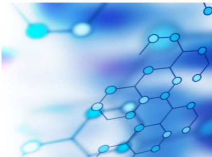
Animated & well structured

The User Adoption toolkit is an enabler to the adoption of Connections and the collaboration tools within an organization. It includes: