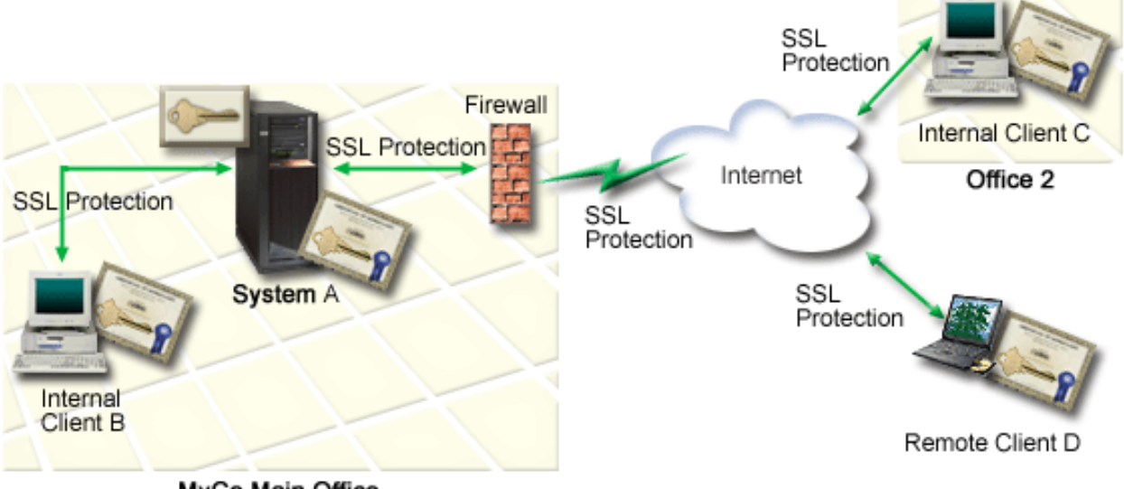
MyCo Main Office

The following figure illustrates the network configuration for this scenario: