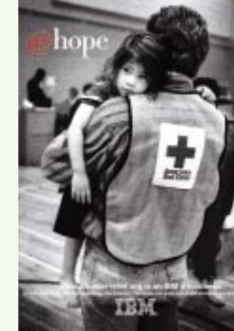
IBM, the American Red Cross and the Cable News Network (CNN) created a Web site for global disaster relief information. The site, www.disasterrelief.org , contains up-to-date coverage of disaster relief efforts, along with the capacity to offer services, support and contributions. IBM is providing the technology, consulting and services for the site, as well as cash contributions to the Red Cross.