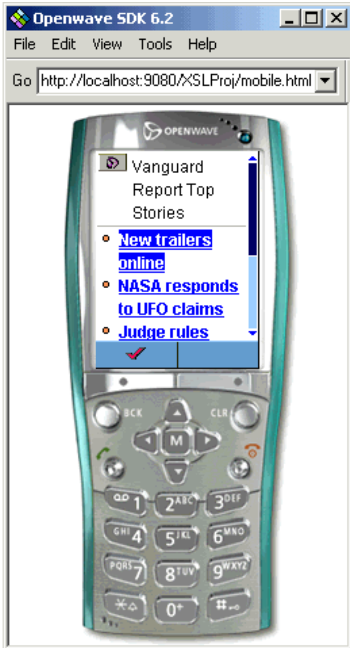
Figure 2. Simpler version of original page created with XHTML Mobil

The idea is that when one of these phones accesses the servlet, the servlet provides this simplified version.