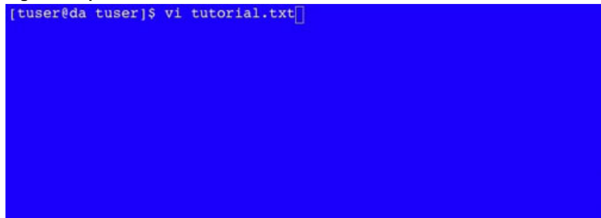
Figure 1. Open vi with a new file

vi opens with a new blank file called tutorial.txt (see Figure 2 ). You'll immediately notice something odd: The far left column of the text editor is filled with tilde characters. Don't worry -- that's how vi illustrates undefined portions of the document. In other words, these lines don't exist yet, because the file has no content.