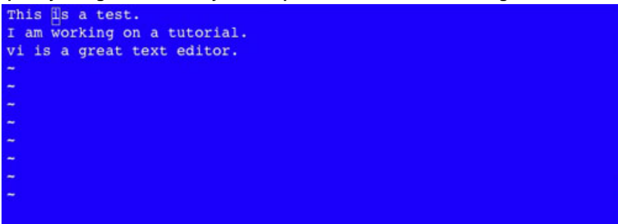
Figure 6. Moving the cursor word by word with w and b is a good way to quickly navigate to a word you misspelled or would like to change

You probably noticed that the w key and the b key set the cursor to the beginning of each word. You can also navigate to the end of each word by using the e key to move forward, or by pressing g . Press e to go backward. See Figure 6 .