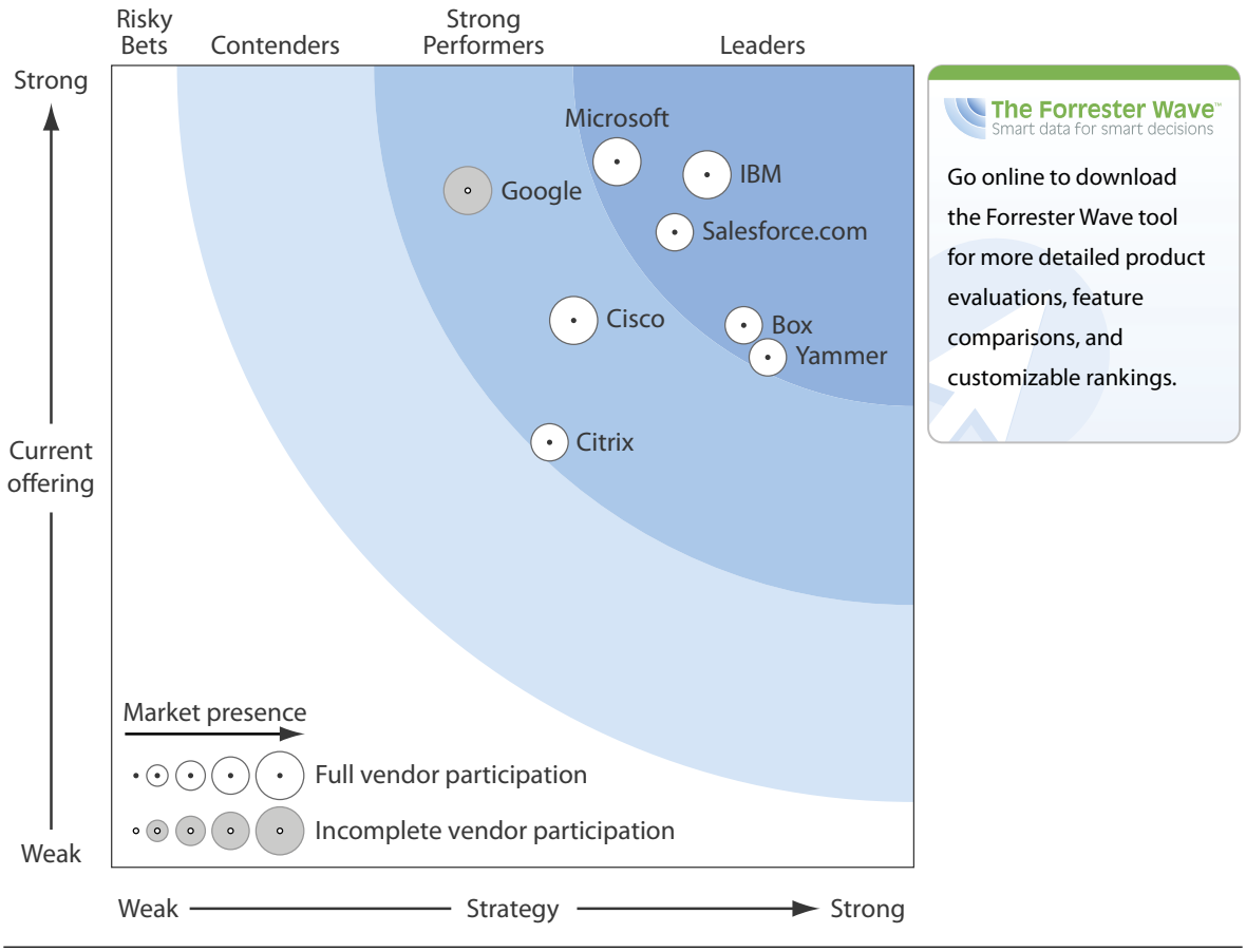
Figure 5 Forrester Wave<sup>™</sup>: Cloud Strategies Of Online Collaboration Software Vendors, Q3 '12